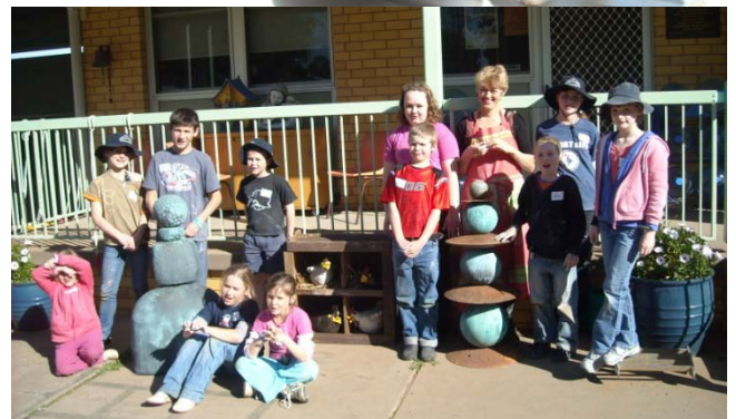
A hard days work enjoyed by all