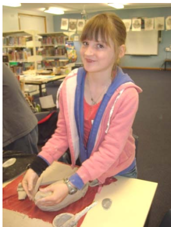
This sort of work pleases me immensely!

An excellent day was had by all. One student thought it was the best day of his entire school life so far!