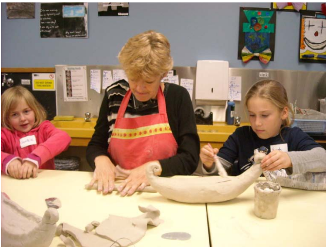
Budding artists and artist at work

The day finished with the boats being painted.