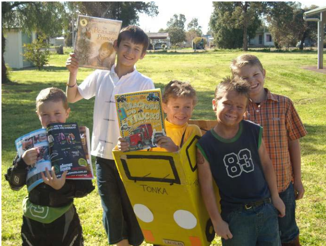
The Peasant Prince, Man from Snowy River, Jacob Black, Tonka and Motorbike man.