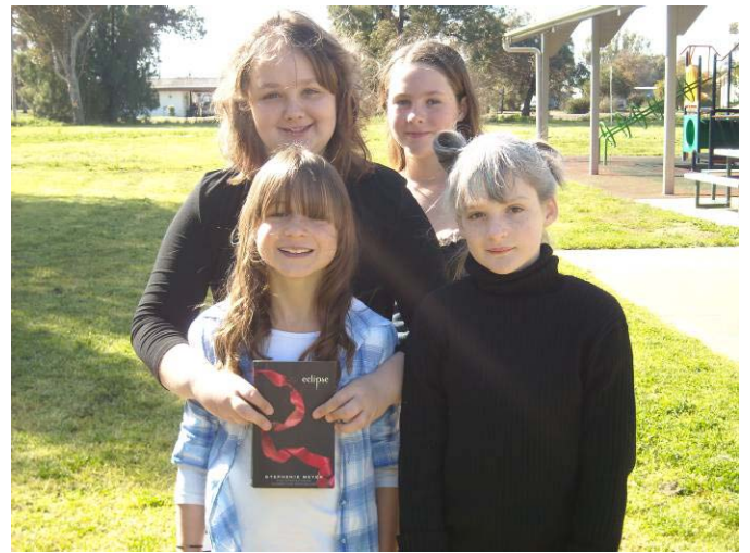
Alice from Twilight, Lady in Waiting, Bella Swann & Gem Dog