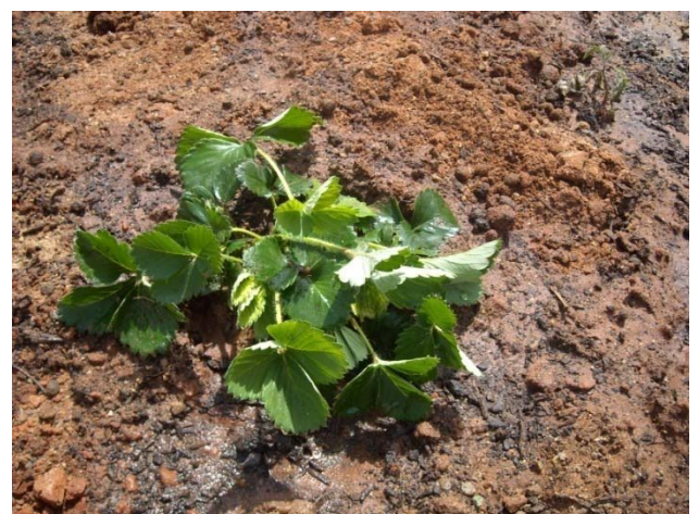
Yummm!!! Strawberries! Can we eat them now?