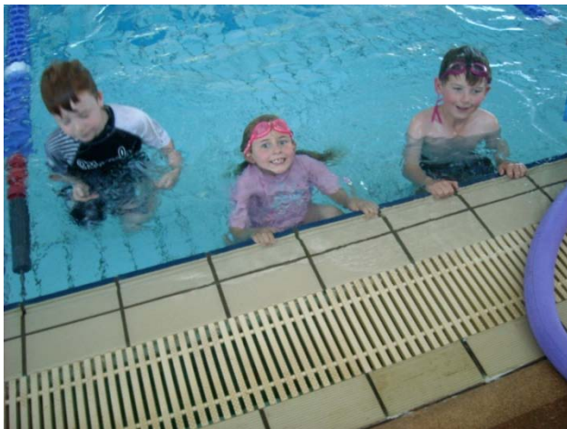
We are having a splashing time!