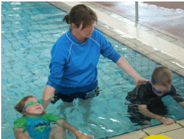
We love swimming!