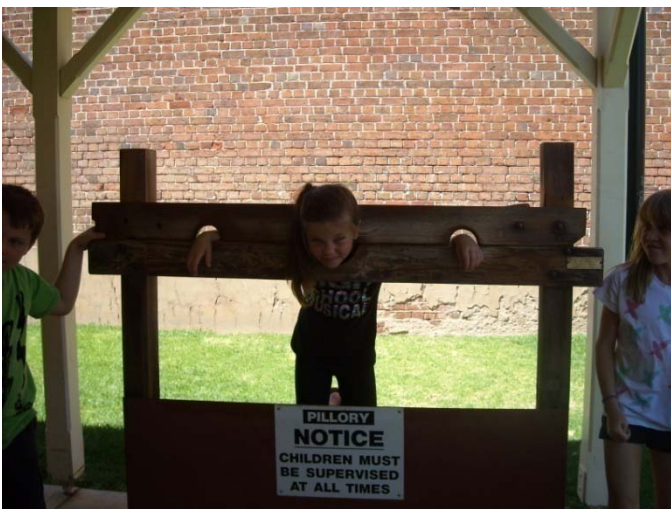
Let me out! I didn't do it!