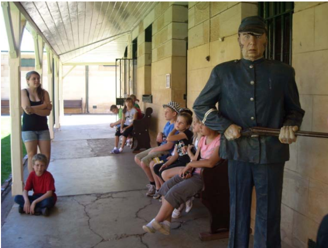
We are being very, very good.