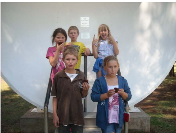
Having a break in Parkes.