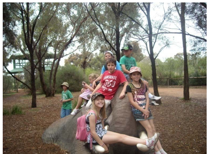
Dubbo Zoo's friendliest elephant.