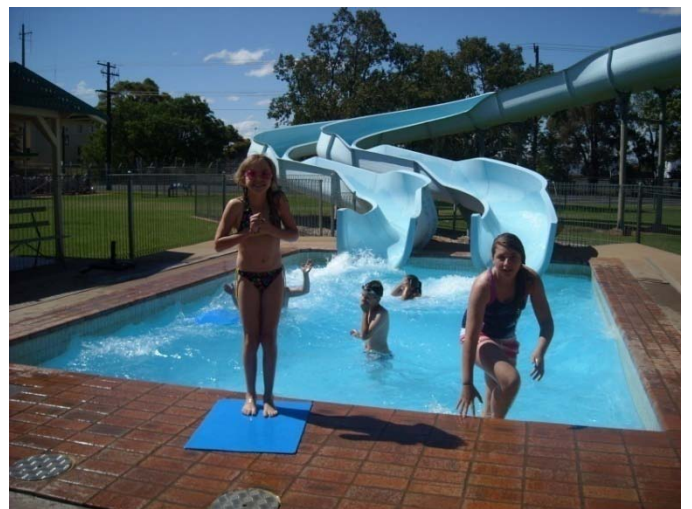
I did it!