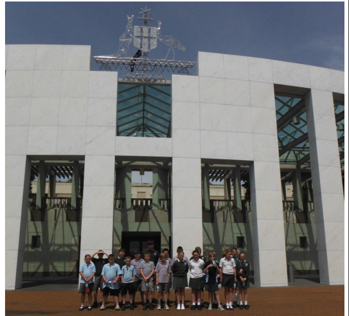
Our group at Parliament House