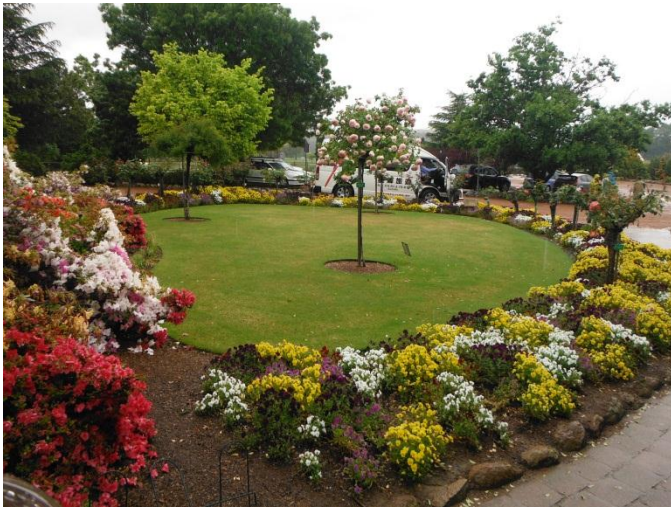
Yes, you guessed it, that's my garden! Would you believe Cockington Green?