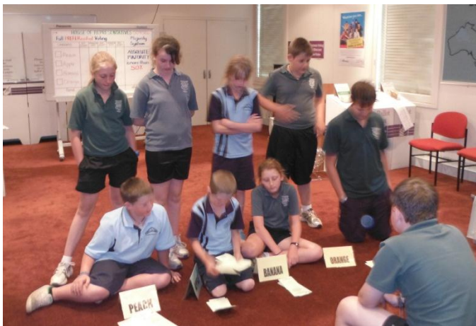
Learning how the electoral process works at the Australian Electoral Commission