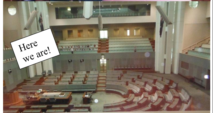
In the Senate and the House of Representatives