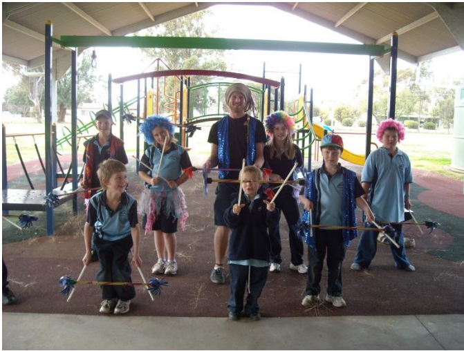
Everybody loves Circus Challenge