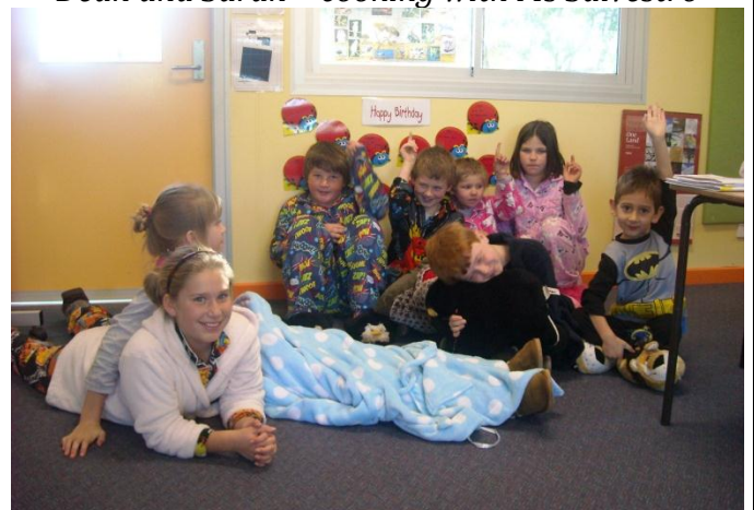
Hard to forget the day we all came to school in our pj's!