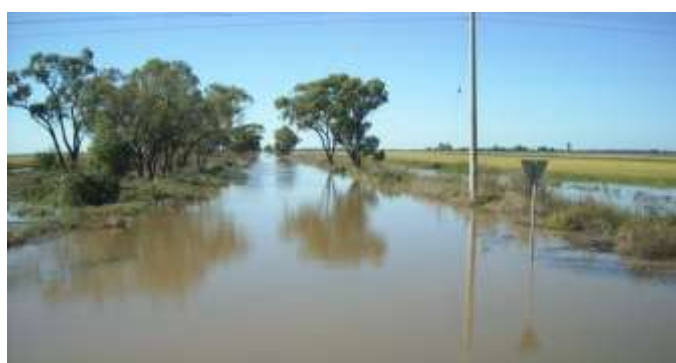
We decided not to go this way!