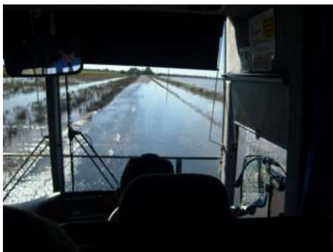
Brogden Road from the bus

On Tuesday 6 th March, Carrathool and Booligal Public Schools travelled to Griffith (through flood waters) to watch this magnificent production. See recounts in this newsletter.