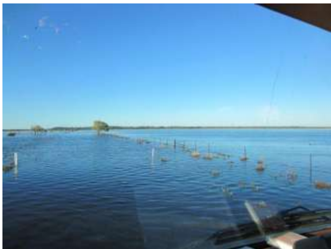
Bringagee Road a few days later