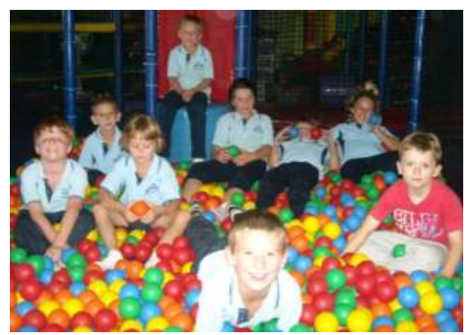
Our group (plus one child who likes being in photos) enjoying a breather at Hunky Dory