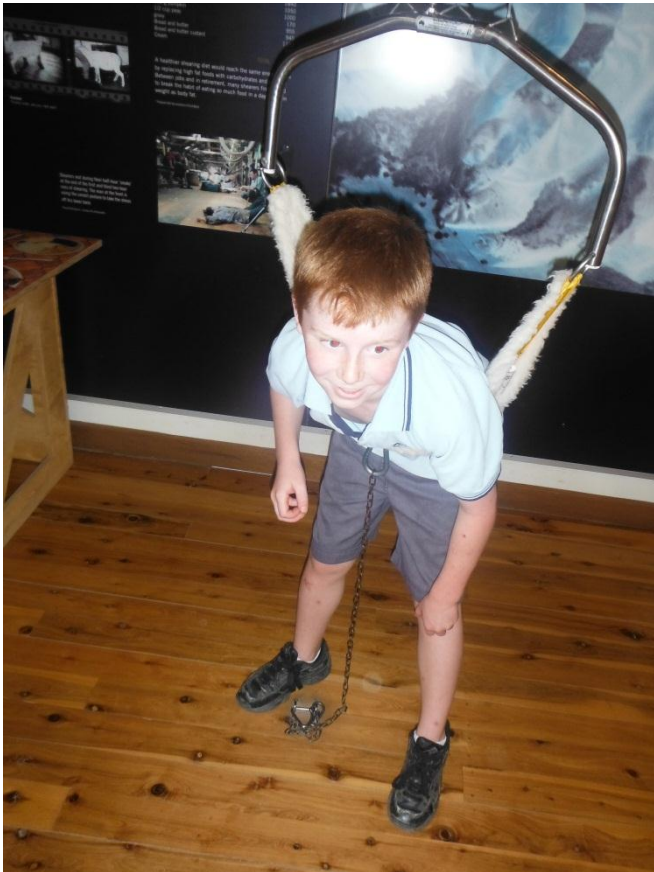
My back was killing me, but now it's fine!