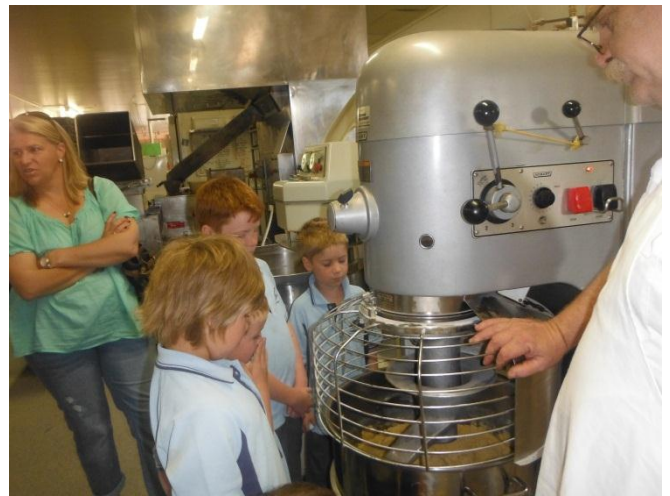
Now that's what I call a mix master!