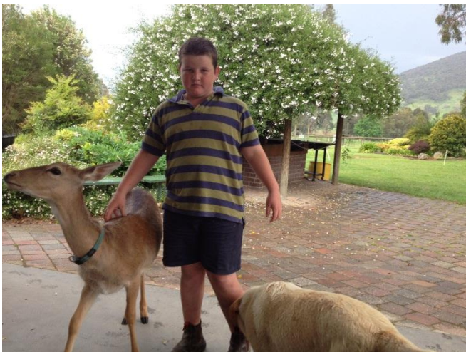
Oh dear, deer!