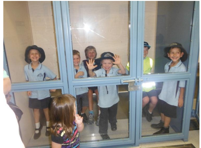
Parents were tempted....

The Hay Police Station was the last stop for the day. The highlight for the children was to be handcuffed and put into the holding cell (naughty children only).