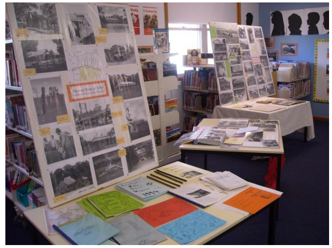
Part of the memorabilia display

We then headed over to the hotel for afternoon tea. The anniversary cake was cut by our oldest student attending and our youngest student currently at the school.