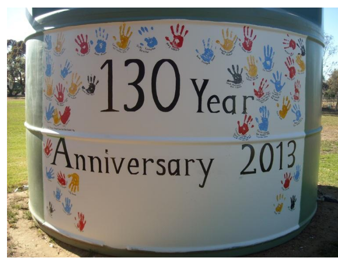
Handprints on the Tank

At the school we had many families handprints painted on a water tank in brightly coloured paint with their names written underneath. They look great!