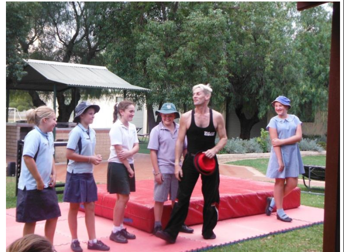
This looks like fun!