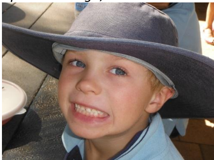
I'm eager to have a go!