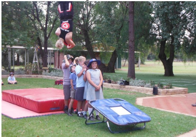
Lining up to have a go, but where's 'Hemlock'?