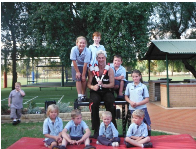
Hemlock and Carrathool Public School