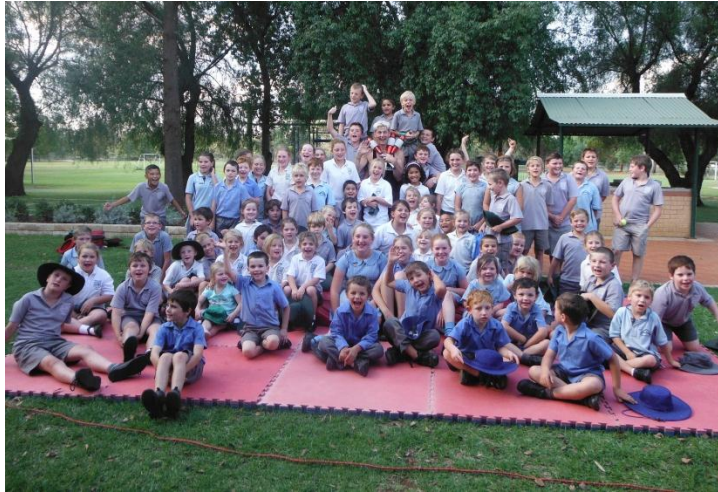
Carrathool and Goolgowi Public School students

Yesterday we went to 'Hemlock the Acrobat, a 45 minute interactive circus show involving equilibrist (balancing) acts and acrobatic feats delivered with flair and showmanship. A question and answer session was integrated into the show to allow young people the chance to find out about life in the performing world. Most of our students joined in. It was very enjoyable!