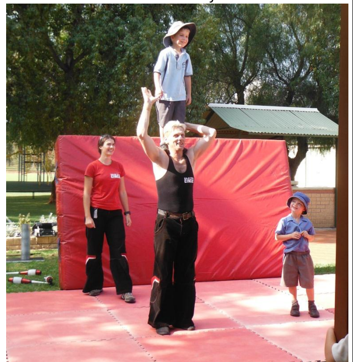
I knew I was tall!