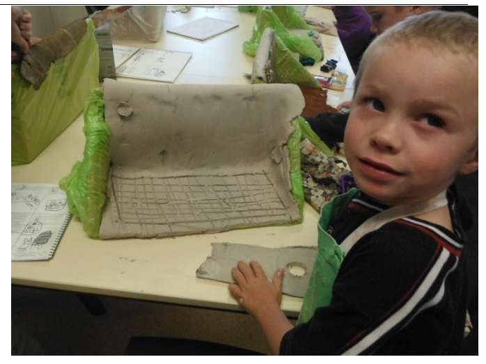
Do you like mine? I do!