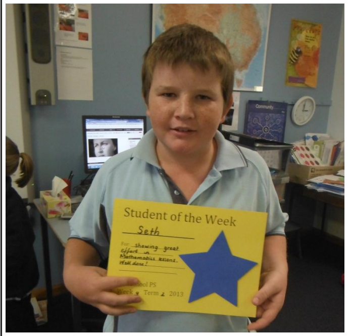
Student of the week - Week 4