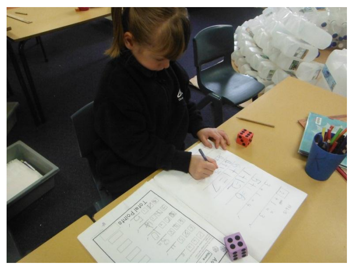
Nobody stop me now! I'm on a roll! (and so are the dice!)

When: 1<sup>st</sup> Wednesday monthly Venue: Community Health Centre, Hay Time: 10.30 am Contact: Merylise 69602835