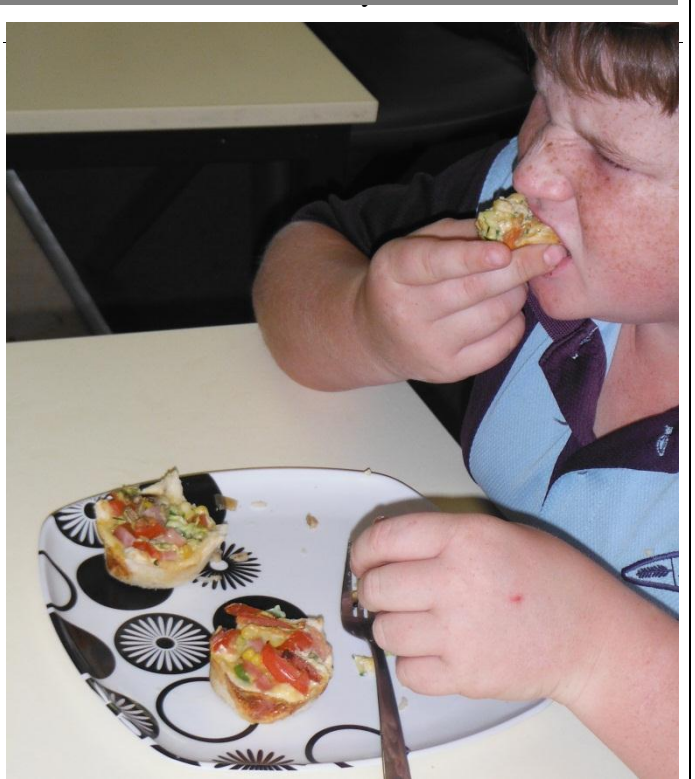
Oops! Might have slipped with the pepper!