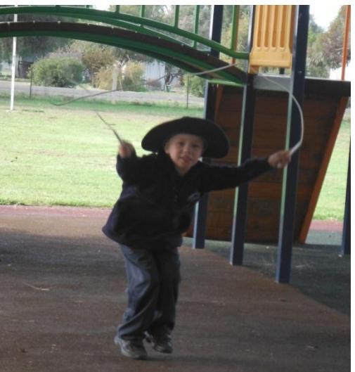
How much fun can a boy have?