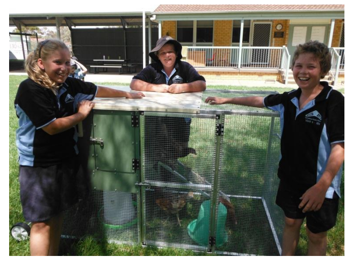
What a good looking bunch of chooks (and kids!)

http://www.youtube.com/watch?v=E5Om77mluK U&feature=share