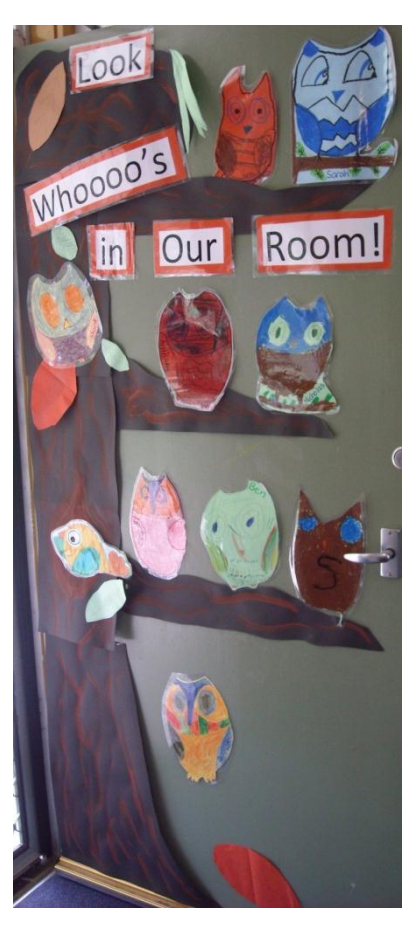
All owls made in the classroom (not from China!)

Next time you visit our Library you might notice 'Whoooo' is the theme for our Library unit.