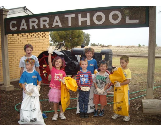
Carrathool is way cleaner now!