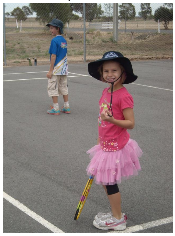
Pretty sure this is the proper attire of most professional tennis players these days!