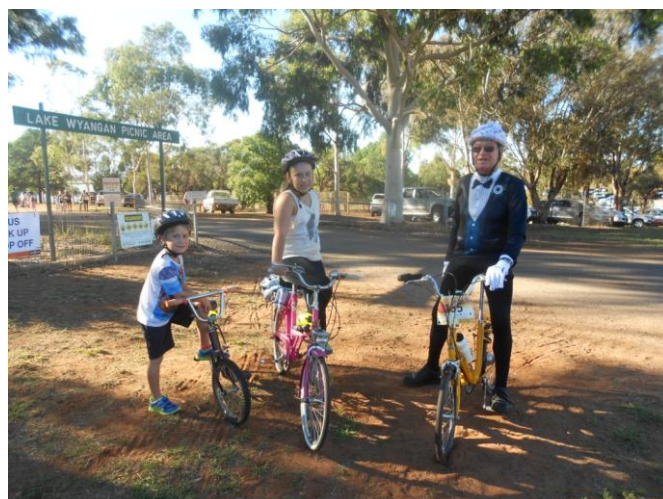
Carrathool Participants in 'Casella' City to the Lake