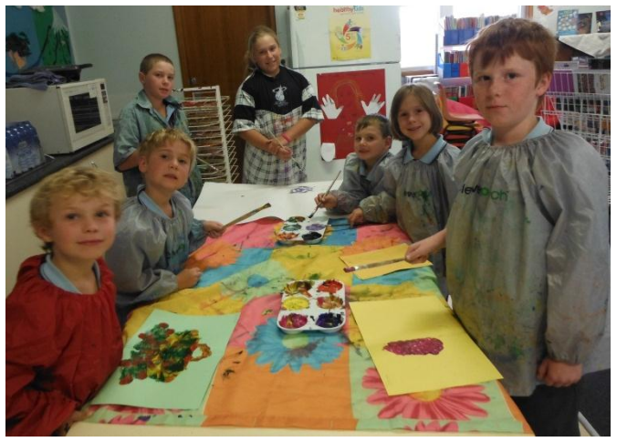
Art – A combined effort to paint a huge butterfly and the finished product!