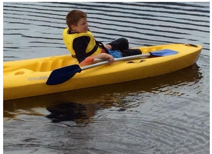
Ah, this is the life!