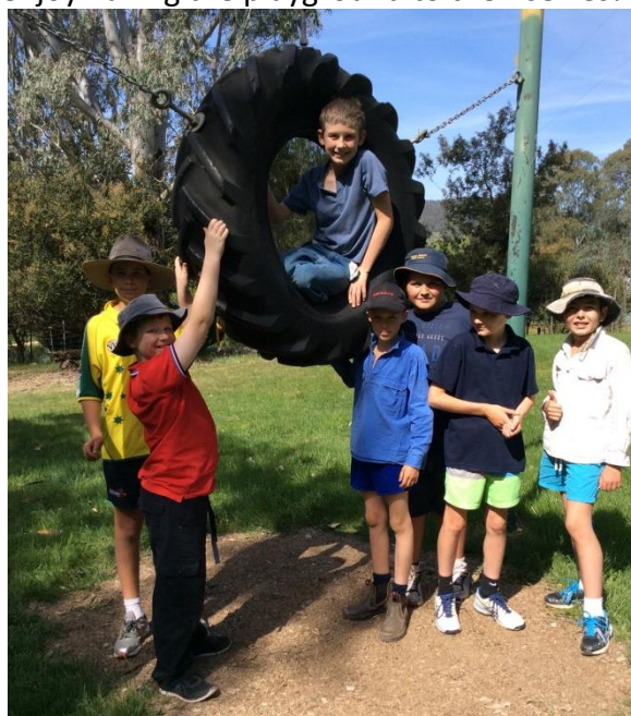
This was 'wheely' fun!

In their absence the juniors were treated to a special lunch from the family hotel. They seemed to enjoy having the playground to themselves!