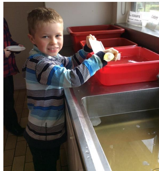
Mum, don't get any funny ideas!