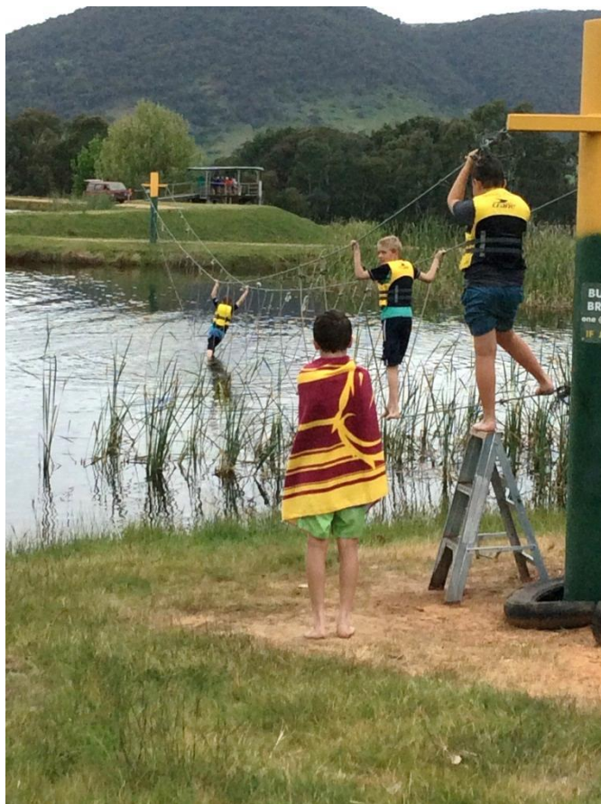
Crossing the 'Burma Bridge' was tricky!

(Please note, there is no meeting this October)