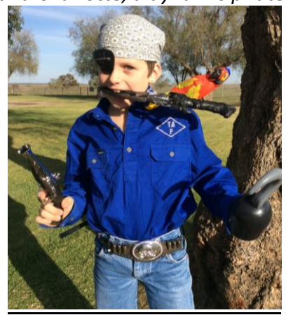
Ahoy, me hearties!!