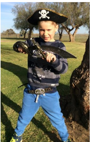
Arrrhh, but wait, there's more...