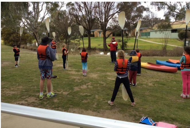
Learning how to kayak