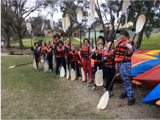
A very happy, but wet and cold crew! And yes, there is always a poser!

Firstly we tried archery and then we hopped into the kayaks. First we put on our life jackets, then we got our oars. We had to help each other get our kayaks in the water and once we hopped in we kept running into each other. Gus blew the whistle and told us to all (in our kayaks) get into a row together. It was so hard, but we eventually did and then we had to get out of the water. When we did, everyone was very wet and just wanted to have a warm shower, but we had to put everything away first and then we had our nice warm showers (Cheyenne).