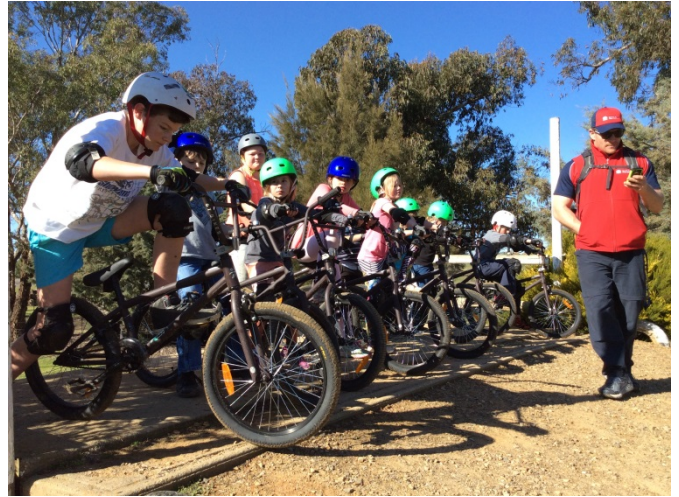
All pretty eager to beat the 'world record'!