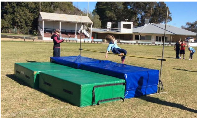
Monica, up, up and away!