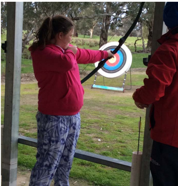
Cheyenne, quick everyone, get out of the way!!!