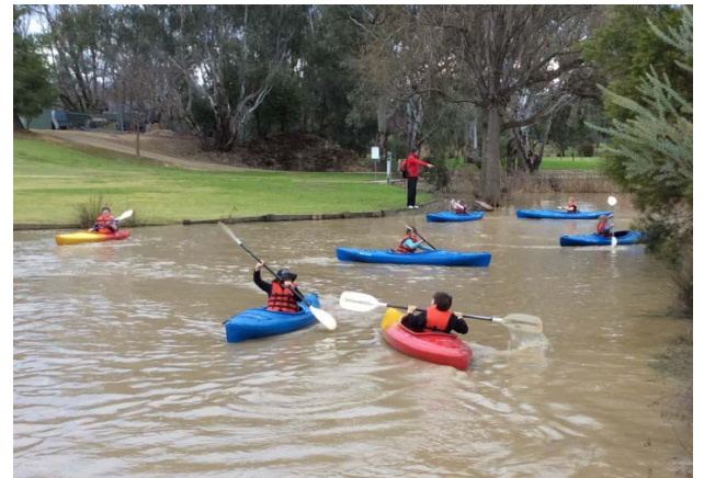
Row, row, row your boat!