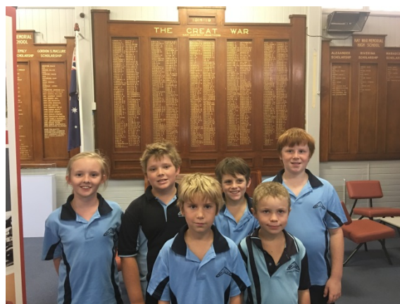
Seniors in Hay War Memorial High School.

The Hillston Lions Club have kindly donated Carrathool Shire Phone Books to the school. Copies are available for purchase from the school for $10 each and all money raised will go toward the recent excursion to Hay.