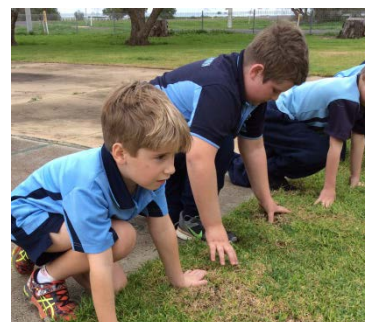
Students practising for the Athletics Carnival.