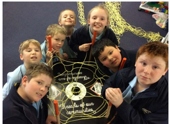
Students using the giant knitting nancy.

Our first visitor to Carrathool Public School this term has been from South West Arts. Students were very quick to learn to use the knitting nancy, working as a team with rapid fire fingers! They produced a long length of knitting to be used in a display in Dubbo later in the year. Students learnt about fibres in our community.