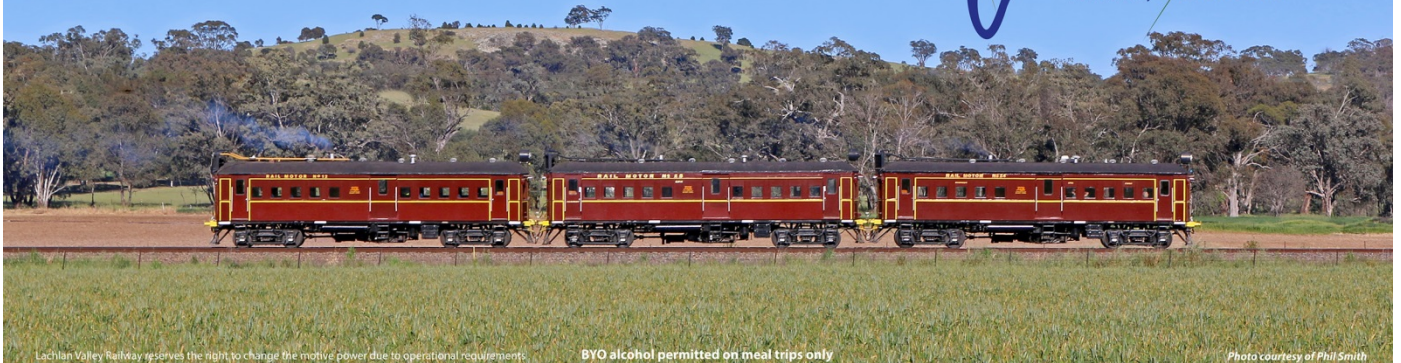
Lachlan Valley Railway reserves the right to change the motive power due to operational requirements.