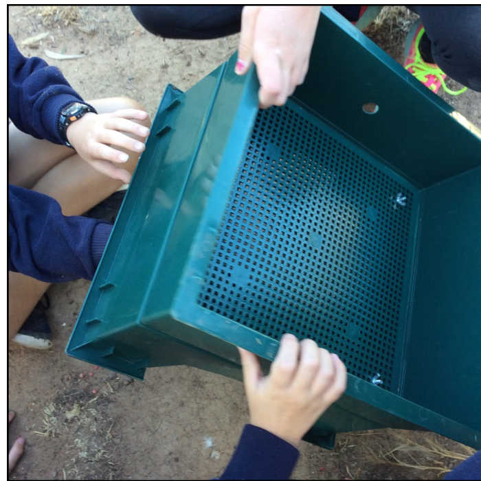
In the process of setting up our new worm farm. Thank you very much Carrathool Composting Facility.