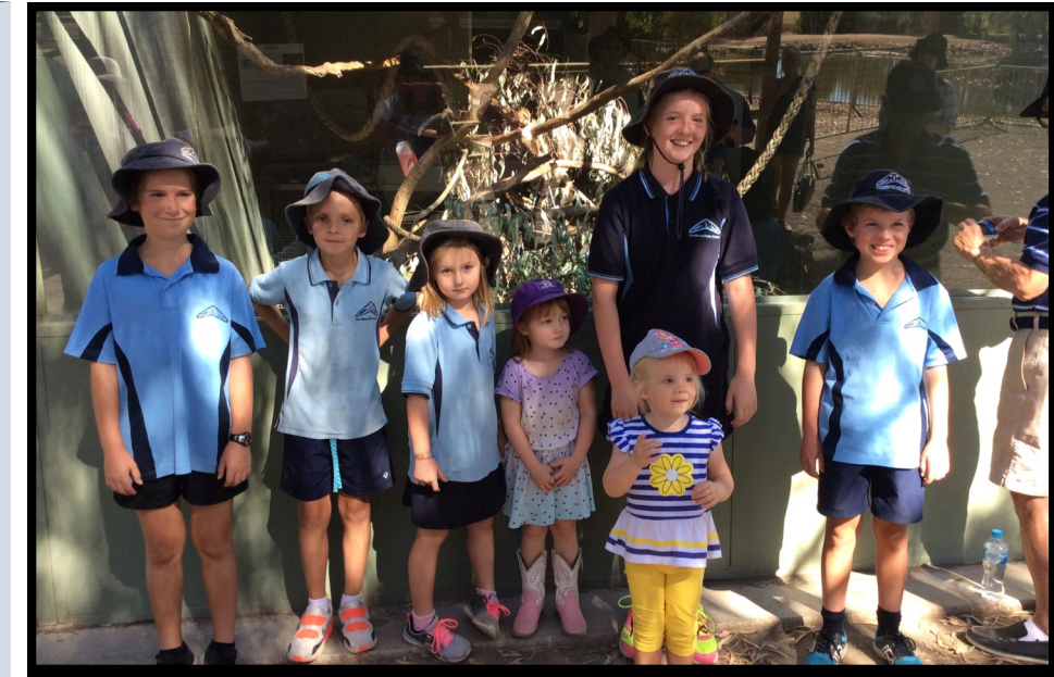
Altina Wildlife Park Excursion