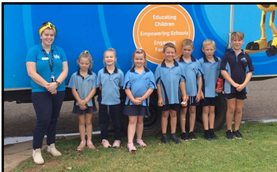
Life Education NSW - Healthy Harold visit