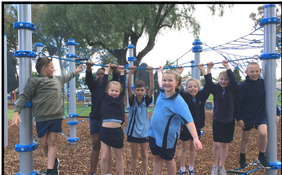
Enjoying the Hay Gaol Park