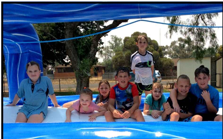
End of Year Fun