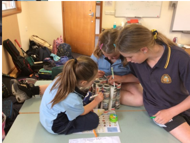
STEM - Making a paper stand to hold a basketball